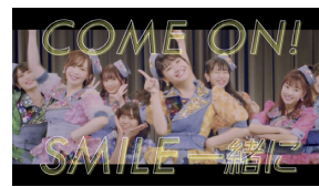
"FUKUOKA. ~Fuku wo kasuru nodas" Music video LinQ