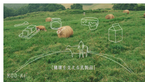
"Food And Health Solution" PV Kaneka Corporation