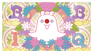
Connect-kun "Tsunageru (connect)" ver. for BBIQ PV QTnet,Inc.

PV Togistu Town People Sokatsuyaku Promotional Committee