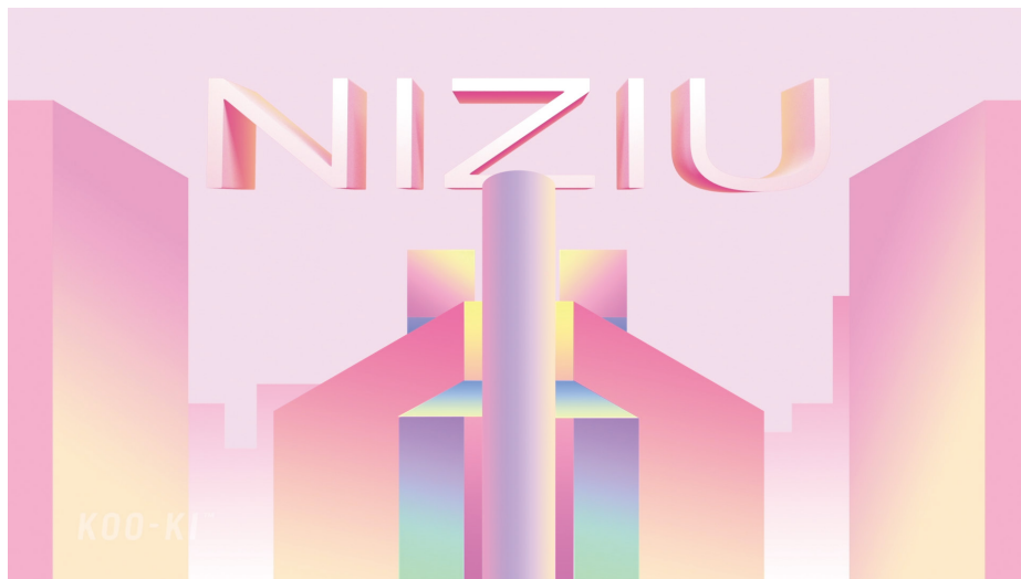
"NiziU," 72nd NHK's Red and White Song Battle

★The 41st Okinawa Advertising Association Advertising Awards(2023) / Gold