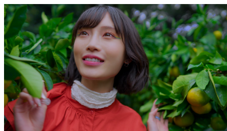
Enjoy Togitshucho 2022, "Magical Time"

PV Togistu Town People Sokatsuyaku Promotional Committee