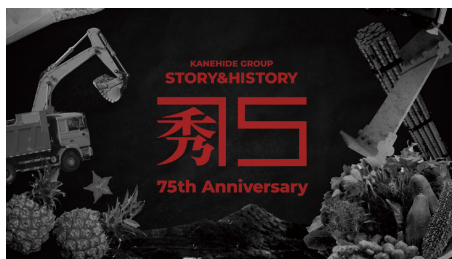
"Kanehide Group 75th Archives"

Background film NHK(Japan Broadcasting Corporation)