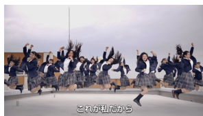
“The Greatest Showman”