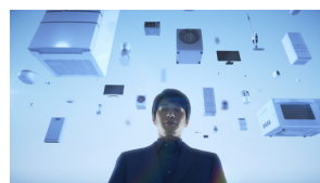
“Forest of Home Appliances”