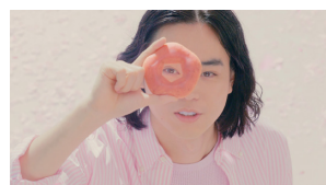
“Sakura Mochitto Donuts”