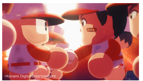
"eBaseball Powerful Pro Baseball 2022 " Opening Movie