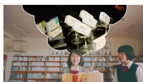
"Miru: Moshimo Shop"