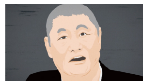
"Asobi tai wa, kataomoi. Asobu wa ryō omoi."