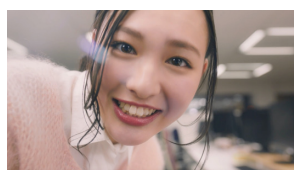
HOT PEPPER beauty