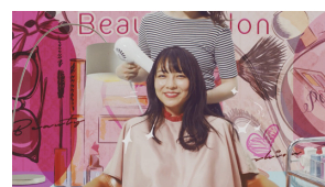
HOT PEPPER beauty "Fukuoka girl"