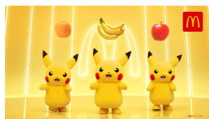
Sweets Trio Fruchu"Debut"