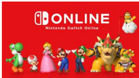
"Nintendo Switch Online"

©2018 Asobism Co.,Ltd. All Rights Reserved. ©2018 PICTOY Co.,Ltd. All Rights Reserved.