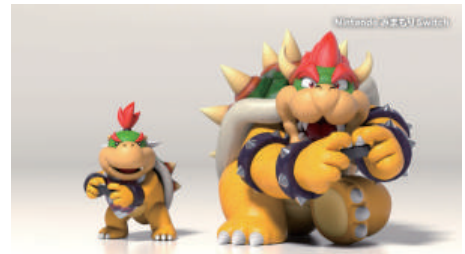
"Nintendo Switch-Parental Controls"