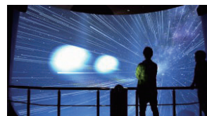
Nikon Museum "Universe of Nikon"