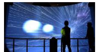
Nikon Museum "Universe of Nikon"