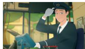
Nishitetsu Bus Group Bus Driver Recruitment