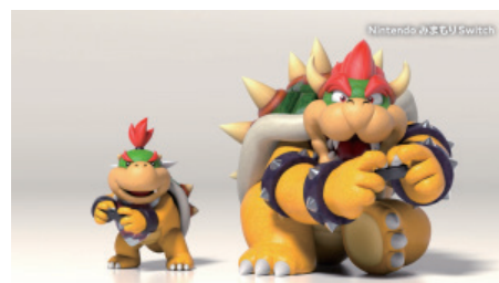
"Nintendo Switch-Parental Controls"