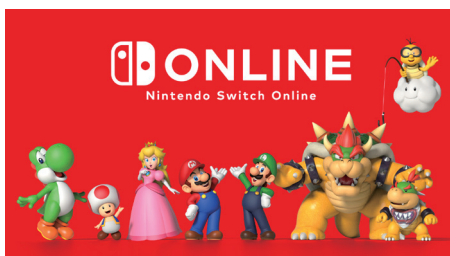
"Nintendo Switch Online"

©2018 Asobism Co.,Ltd. All Rights Reserved. ©2018 PICTOY Co.,Ltd. All Rights Reserved.