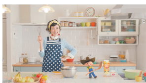
"Sujahta Boya Toujou"