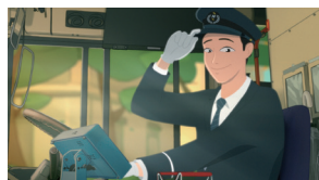
Nishitetsu Bus Group Bus Driver Recruitment